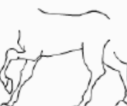
a horse's body