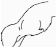
a lion's body