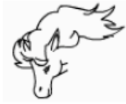
a horse's head