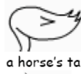
a horse's tail