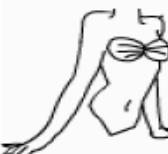
a woman's body