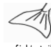
a fish's tail