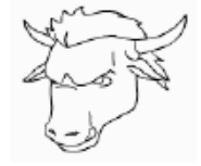
a bull's head