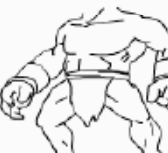
a man's body