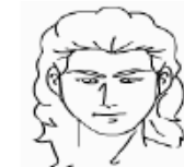
a man's head

Now think of a name for your monster and write about it. Use the example of the Chimera to help you.