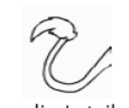
a lion's tail